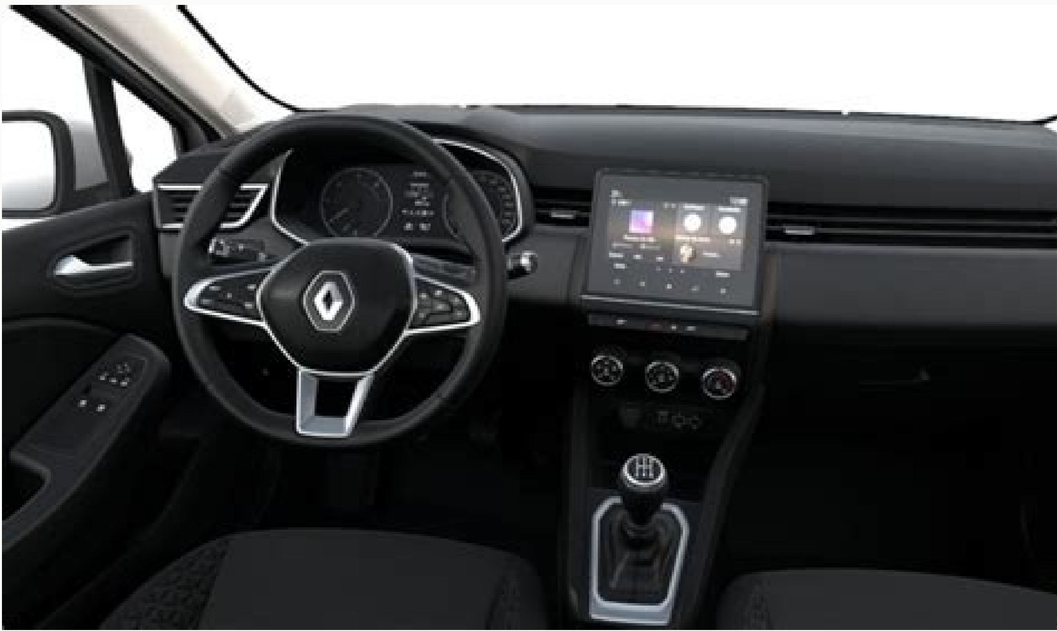
Android auto bluetooth usb dongle.